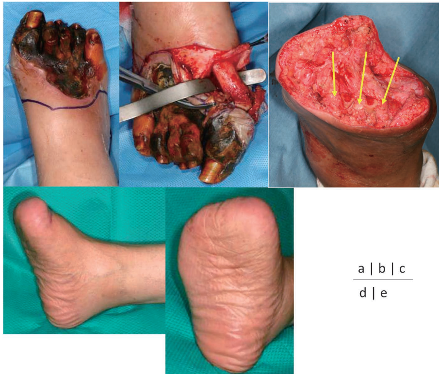
Fig. 1 (a) A 52-year-old woman (case 1) with right foot gangrene. After revascularization by femoral–popliteal bypass surgery, the skin perfusion pressure values of the dorsum and plantar were 42 and 35 mmHg, respectively. (b) The modified transmetatarsal amputation is performed. (c) The vascular complex (arrows) between the metatarsal bone is preserved. (d, e) The patient has been able to walk with custom-made footwear for 10 years postoperatively.

of the ischemic foot, Terashi et al. 3) proposed the use of dynamic skin perfusion pressure (SPP). SPP is one of the most reliable measurements for accurately predicting wound healing because it can measure the blood flow state at the adjacent point to the wound exactly. 4,5) To identify the main source artery of the wound area, they measured SPP while occluding one of the main arteries by hand. For example, if SPP at the target point decreases when the ATA is occluded manually, it means that the main source artery at the target point is the ATA.