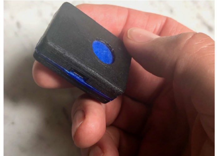
Figure 1. One Button Tracker. It is a data acquisition instrument in a 3D printed plastic casing that can be charged via a USB port. It was designed to track any subjectively experienced phenomenon.

Data stored on the device can be accessed by connecting the One Button Tracker to a laptop or desktop computer via a USB connection. The stored data file containing timestamps and button press durations can be loaded into a web-based data analytics tool. There, the collected data are automatically displayed in an overview table. In addition, several graphs are created that portray the average number of button presses per hour, day, week, and month (examples of visualizations from the data analytics tool are shown in Multimedia Appendix 1).