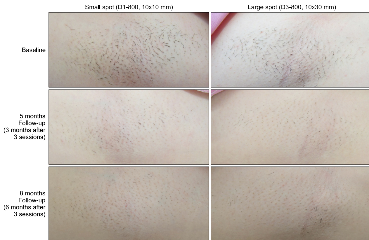
Fig. 1. Photographs of axillary areas treated with the small- and large-spot long-pulsed diode laser at baseline, after three treatment sessions, and at the 6-month follow-up in the same subject.

The most common discomfort during laser hair removal was pain. A VAS was used in this trial to measure the pain in both sides shortly after the first treatment session. The mean VAS score was 3.1 (median, 3.0; range, 0.5 ~ 6.3) with the D1 and 4.3 (median, 4.7; range, 1.1 ~ 6.9) with the D3 handpiece, showing a statistically significant differ-