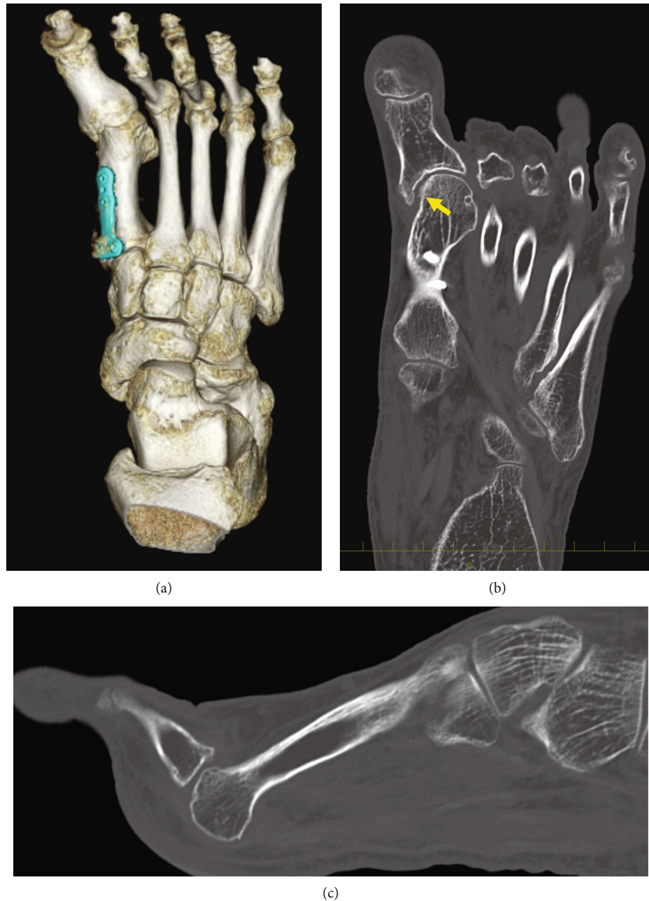
FIGURE 2: Preoperative CT images. (a) 3DCT image. (b) Coronal image. Arrow indicates decreasing the surface area of the medial side of the articular surface at the first metatarsal head by resection of the bony prominence. (c) Dorsal dislocation of the 2nd toe. CT: computed tomography; 3DCT: three-dimensional computed tomography.

plate with screws (Variax Foot, Oblique T plate, Stryker, Mahwah, NJ, USA).