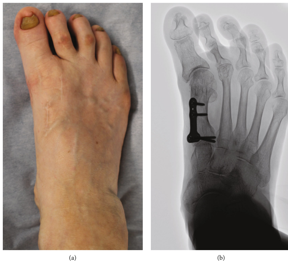
FIGURE 1: Preoperative appearance (a) and plain radiograph in the standing position (b). The hallux valgus angle was -24^\circ and the intermetatarsal angle 0^\circ .

lateral collateral ligament (LCL) reconstruction of the first MTP joint using a suture tape anchor device, with satisfactory clinical outcomes.