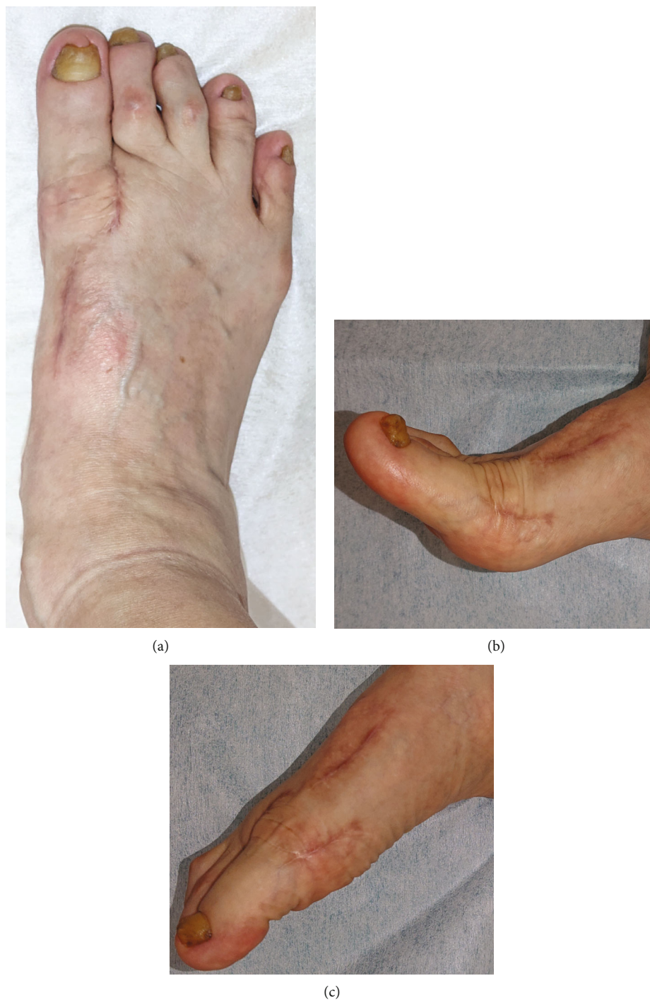
FIGURE 4: Appearance of the foot (a) and active motion of the great toe at one year postoperatively. (b) Dorsiflexion. (c) Plantarflexion.