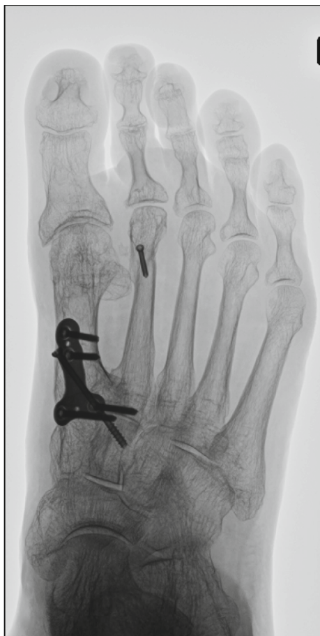
FIGURE 5: Radiograph one year postoperatively. The hallux valgus angle was 4^{\circ} and the intermetatarsal angle 8^{\circ} .

preserving surgery should be performed. The first-line procedure is medial capsule release in the retracted part of the first MTP joint including the abductor hallucis tendon, which provides the deforming force toward hallux varus [15]. Subsequently, fibrosis is released in the first intermetatarsal space to restore the intermetatarsal divergence and valgus phalanx positioning. These procedures are convenient, but insufficient to maintain reduction, and usually require additional techniques such as tendon transfer and bony correction [16]. Tendon transfer with the abductor hallucis or extensor hallucis longus tendon aims to compensate for the LCL and uses either a dynamic technique with the muscle body or a static technique without. Although this may achieve stabilization of the lateral side of the MTP, there are several disadvantages. In dynamic transfer, tension is difficult to adjust, and there is a risk of long-term tension loss, while adjusting the tendon in static transfer is simplified and stabilizes over time. However, incorrect positioning of the transfer in either method can make the joint nonfunctional, and the procedures are complicated. Above all, donor site morbidity, including functional loss and surgical invasion, should be considered. To avoid these complications, we performed the LCL reconstruction using suture tape.