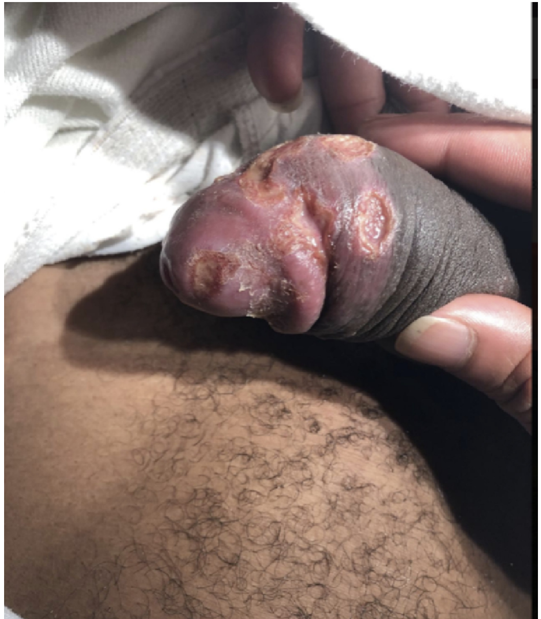
FIGURE 1: Lesions on the glans and distal penile shaft.