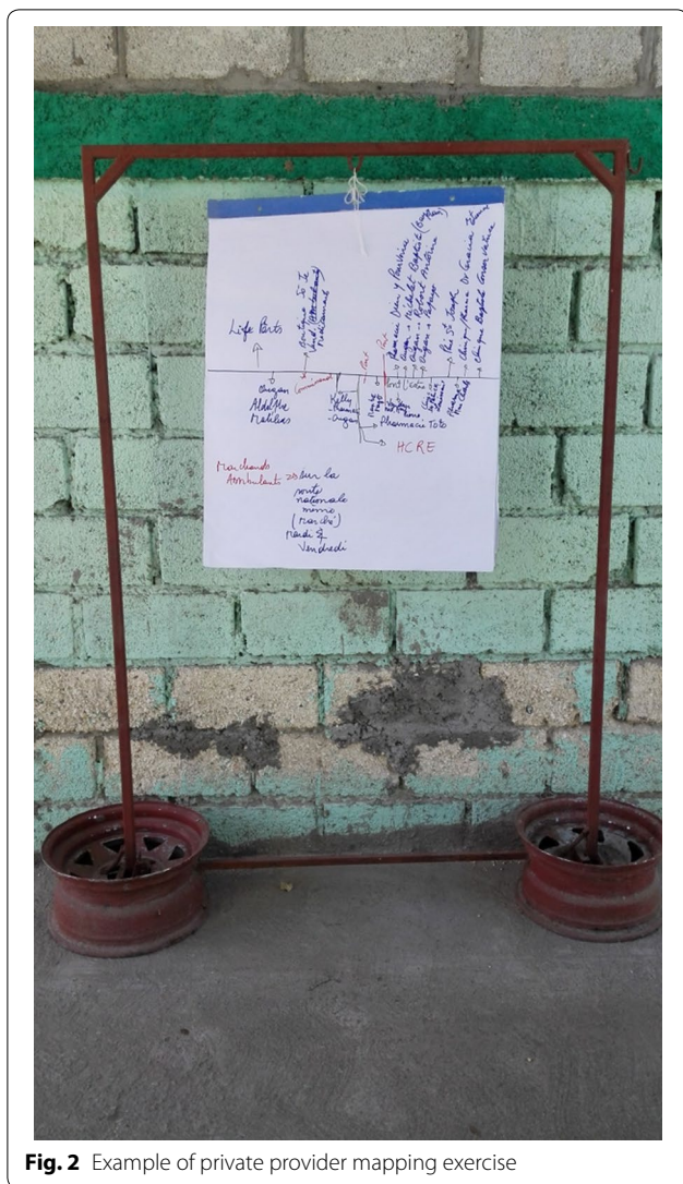
Fig. 2 Example of private provider mapping exercise