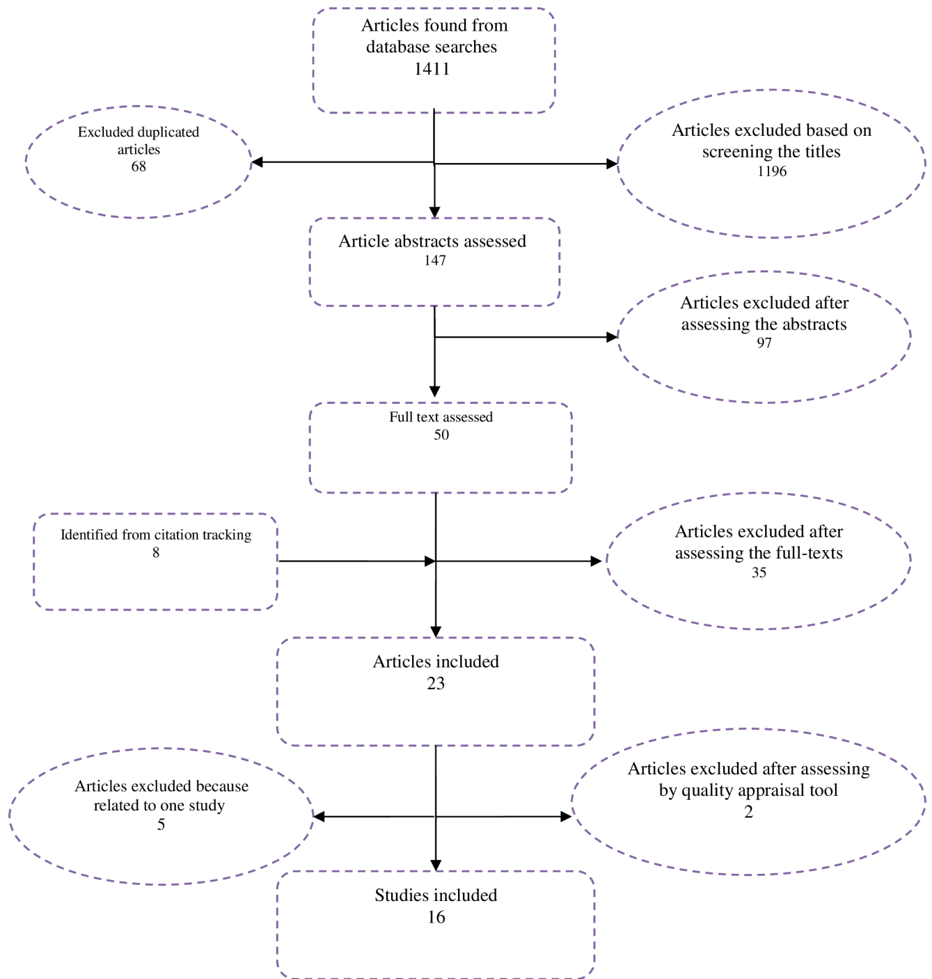
Fig 1. Article flowchart for studies of WTP for insurance demonstrating the studies identified assessed and included in the systematic review.