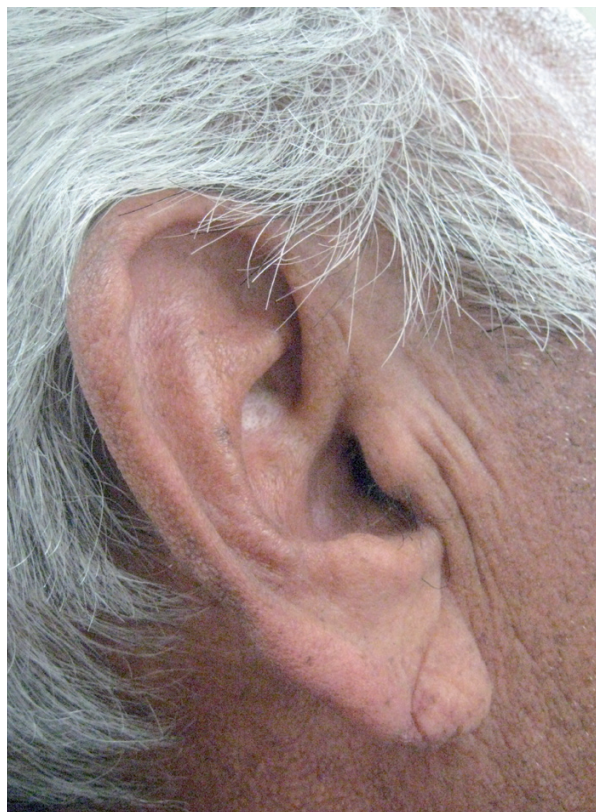
Fig. 2. The same patient with a somewhat less distinct diagonal ear lobe crease on the right side.