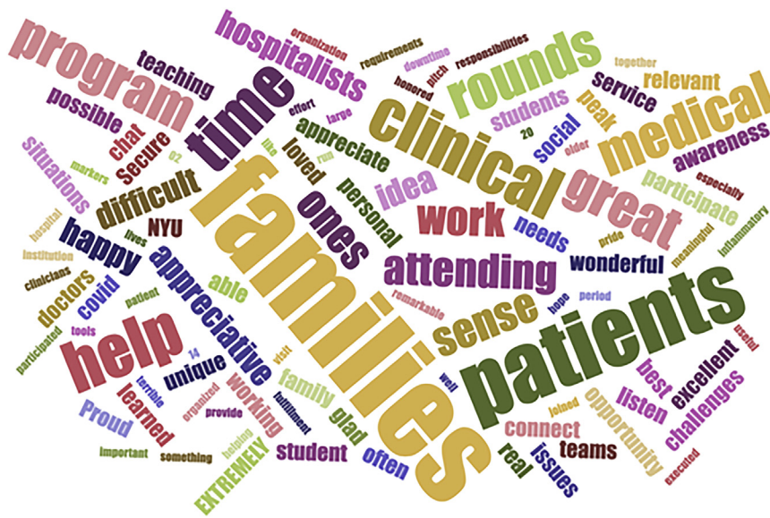
Fig 3. Word cloud created from free-text responses for survey question: “Please share any other feedback regarding your experience in the program.” The cloud shows greater font size for words that appear more frequently in the source text.

radiologists felt that they would alter their communication practices. Pediatric and breast radiologists have frequent interactions with patients in their practice because of the large number of procedures that they perform, which may have influenced the differences in expected practice change. Nevertheless, the majority of the remaining survey participants responded that they expected their communication with patients and families would change. Given the increasing interest in providing patient-centered care in radiology practice because of its potential to improve the quality of patient care [7,8], these radiologists’ newfound comfort of communicating with patients and families is important. In addition to time limitations and workload, Kemp et al found that 50% of surveyed radiologists identified resistance to culture change as an impediment to direct communication with patients [9]. Perhaps the FC experience will lower the resistance threshold for increased patient and patient family communication by radiologists.