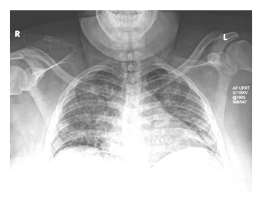
Fig. 1. Chest X-ray on day of presentation showing prominent interstitial markings.

features. Her postoperative course was complicated by endometritis treated with 7 days of antibiotics. Her renal function continued to decline, resulting in significant acute kidney injury with associated volume overload. Serum creatinine peaked at 3.87 mg/dL, though she never required dialysis and had gradual improvement in serum creatinine. Intensive care unit (ICU) admission was required on hospital day 10 for worsening hypoxia, which quickly improved after aggressive diuresis. Transesophageal echocardiogram demonstrated normal systolic function, and chest computed tomography was negative for pulmonary embolism but did demonstrate bilateral ground glass opacities typical of COVID-19 infection (Fig. 2).