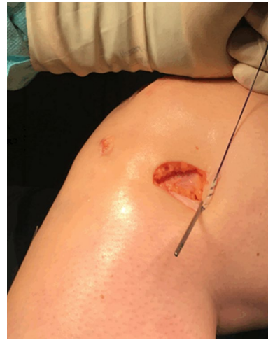
Fig. 4 The k-wire was attached 1 cm proximal and posterior to the lateral epicondyle

Statistical analysis was performed using IBM® SPSS® Statistics Version 25. For continuous variables the mean \pm standard deviation was used. The calculation was based on two groups: patients with isolated revision ACLR or additional LET and revision ACLR. A subgroup analysis was performed to compare patients with pivot-shift grade 2 between the two groups. Differences between the groups were calculated with the Student’s t test and the Kruskal–Wallis test for non-parametric parameters. Categorical parameters were compared using the chi-squared test and the Fisher’s exact test was used for categorical parameters in case of small subgroups ( n < 5 ). A p value less than 0.05 was considered significant.