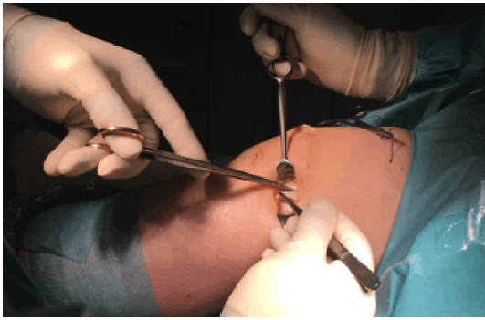
Fig. 2 A strip of the distal ‘tractus iliotibialis’ with connection to the Gerdy tubercle was dissected