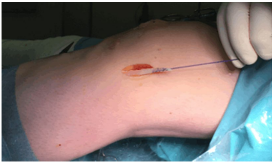
Fig. 3 The strip of the distal ‘tractus iliotibialis’ was secured with a Vicryl suture

the LET in revision ACLR. In the area of the lateral epicondyle, an approximately 4 cm skin incision was made (Fig. 2). A strip of the distal ‘tractus iliotibialis’ (6–8 cm long and 6–8 mm wide) with connection to the Gerdy tubercle was dissected. The strip was secured with a Vicryl suture (Fig. 3) and attached 1 cm proximal and posterior to the lateral epicondyle (Figs. 4 and 5) via a 5 mm tunnel and an interference screw at 45° flexion [27].