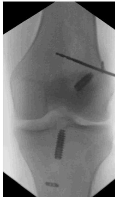
Fig. 5 X-ray of the knee with the k-wire placed 1 cm proximal and posterior to the lateral epicondyle

Overall, there were 78 patients (males = 48, females = 30) with revision ACLR with low-grade anterior knee laxity with a mean age at revision surgery of 32.3 \pm 10.6 (16–55) years. There were no differences between an isolated or combined LET and ACLR regarding age, gender, side of the knee, body mass index and further characteristics (Table 1).