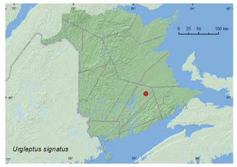
Map 8. Collection localities in New Brunswick, Canada of Urgleptus signatus .

Collection and habitat data. This species was captured in Lindgren funnel traps baited with ethanol deployed in the canopy of an old red oak forest. Adults were collected during July, August, and September. Larvae live in branches of various hardwoods, such as Acer , Cornus , Quercus , and Tilia (Lingafelter 2007).