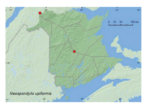
Map 1. Collection localities in New Brunswick, Canada of Neospondylis upiformis .