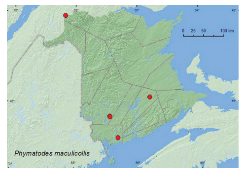
Map 4. Collection localities in New Brunswick, Canada of Phymatodes maculicollis .