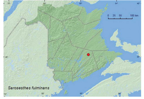
Map 6. Collection localities in New Brunswick, Canada of Sarosesthes fulminans .

VII.2009, 19.VIII-2.IX.2009, R. Webster & M.-A. Giguère, old red oak forest, Lindgren funnel traps (59, AFC, NBM, RWC); same locality and forest type, 29.VI–7. VII.2011, 20.VII–4.VIII.2011, M. Roy & V. Webster, old red oak forest, Lindgren funnel traps (4, AFC, NBM).