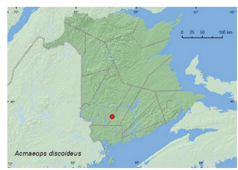
Map 2. Collection localities in New Brunswick, Canada of Acmaeops discoideus .