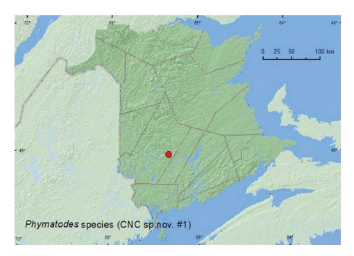
Map 5. Collection localities in New Brunswick, Canada of Phymatodes species (CNC sp. n. #1).