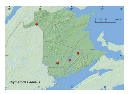
Map 3. Collection localities in New Brunswick, Canada of Phymatodes aereus .