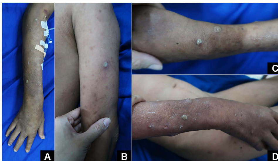
Figure 1 Pustules on upper extremities (A–C). Pustules, erythematous nodules and shallow ulcers on right lower arm (D).

The patient admitted that he was in psychological distress due to his condition. Physical examination showed pendulous earlobes, moon face, and gynecomastia. There were pustules on the center of erythematous nodules on the extremities (Figure 1A–C), erythematous nodules, and shallow ulcers (Figure 1D). Neurological examination revealed that both ulnar nerves were enlarged and rubbery, without tenderness. There was hypesthesia of the skin lesions on both arms, hands, legs, and feet, without gloves and stockings anesthesia. On slit-skin smear, mean bacterial index (BI) and