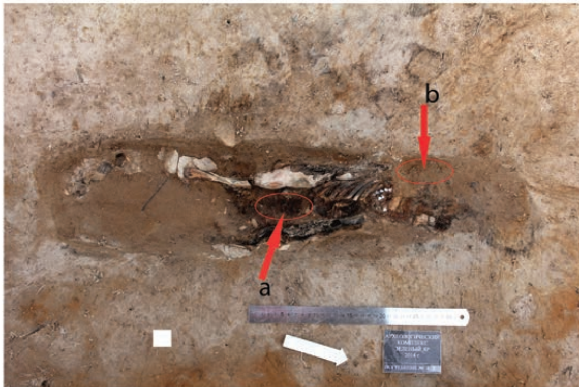
Fig. 2: infant skeleton was excavated at Zeleniy Yar and place of sampling. a: the place of abdomen where the soil sample was collected for the paleoparasitological study. b: the place where the control soil sample was collected.

some support made from perishable material was placed under the head. The infant was wrapped in a fur garment adorned with copper plates, which was further wrapped in a hide with fur and a layer of birch bark (Gusev 2015).