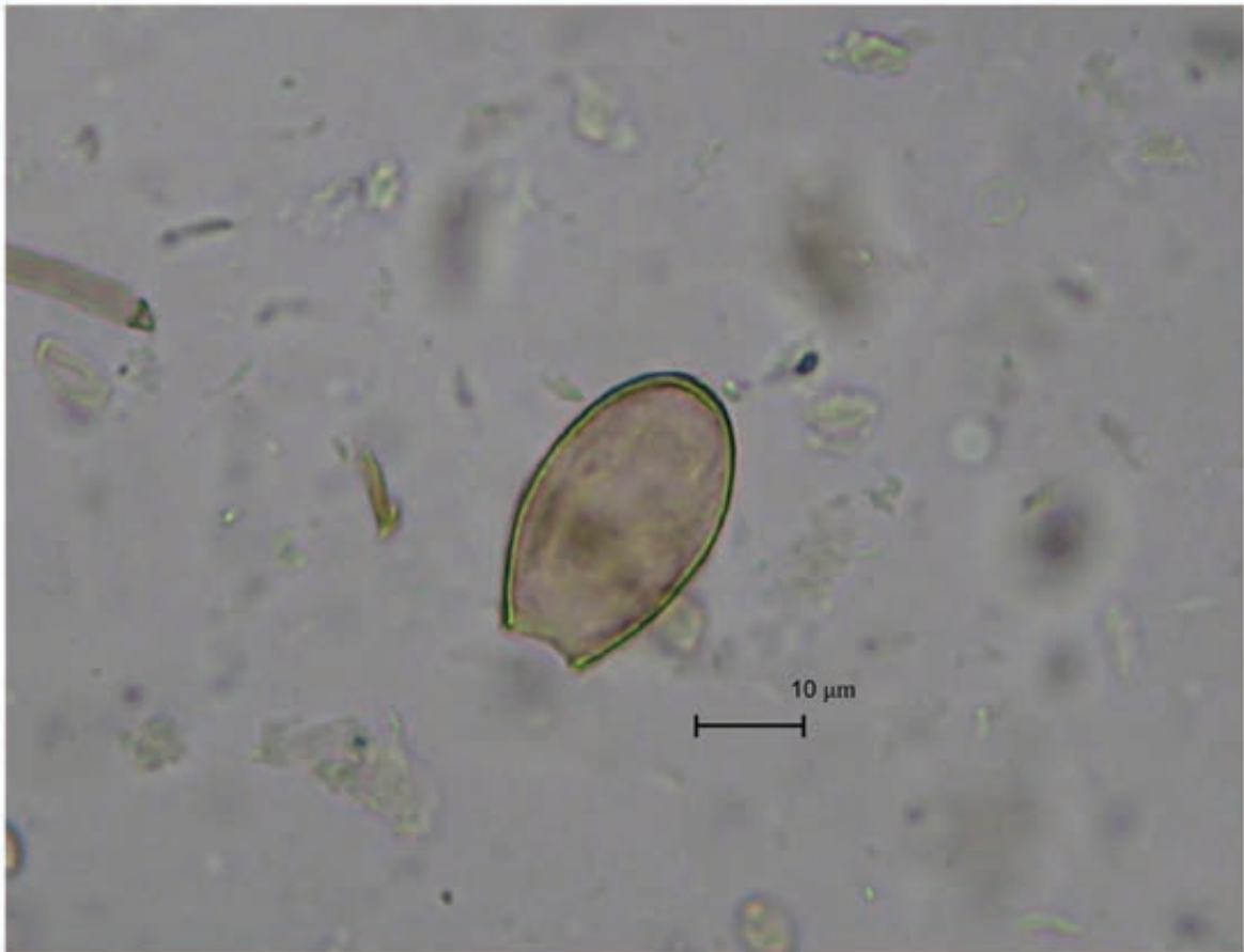
Fig. 3: eggs suggestive of Opisthorchis felineus found in infant remains from the medieval Zeleniy Yar burial ground of XII-XIII centuries AD.

Autonomous Okrug (with Zeleniy Yar burial ground there) has the highest incidence of this helminth infection among humans in the region. Some records show 340.3 cases per 100,000 people (Rospotrebnadzor State Reports 2011). In the Ural Mountain area and Eastern Siberia, D. latum is the most common fish tape worm infecting humans. In Western Siberia Diphyllbothrium dendriticum and Diphyllbothrium ditremum are also common in humans, although the epidemiological impact of the latter on the local human populations is minimal (Yastrebov 2013).