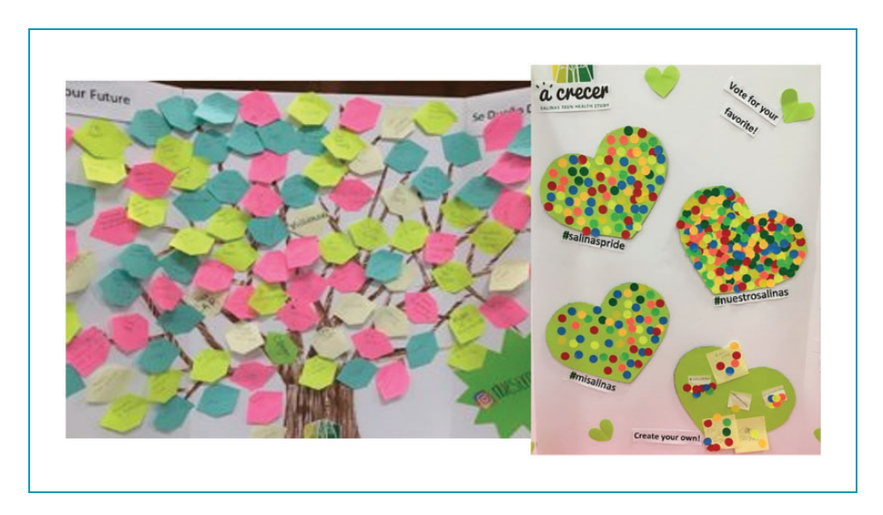
Figure 1. Illustrative youth engagement activities.

Note: tabling activities included asking teens to write down their future goals on sticky notes to add to a vision board (the tree poster) and to vote for the hashtag and handle for our account, which we then featured in our Instagram posts.