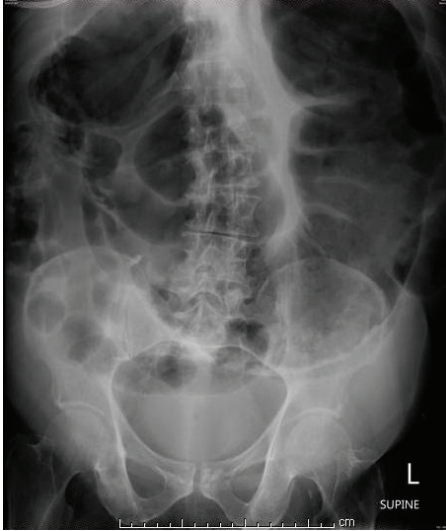
FIGURE 1: A plain abdominal X-ray showing the colonic dilatation with a cutoff at the rectum.