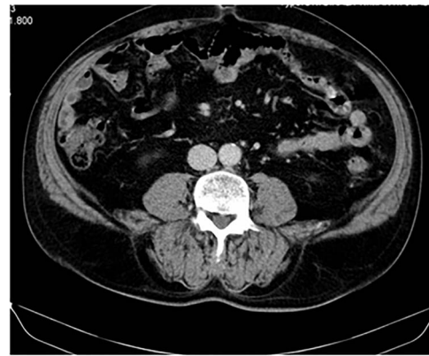
Figure 3: CT image at 1-year follow up showing no local tumor recurrence.

No complications or remission signs were found, lung nodules remained stable and the patient remained asymptomatic (Fig. 3).