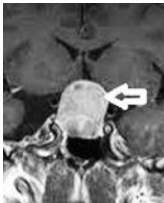
Figure 3 Coronal view, post-contrast T1 brain magnetic resonance imaging, showing a pituitary macroadenoma with compression of the optic chiasm (arrow).