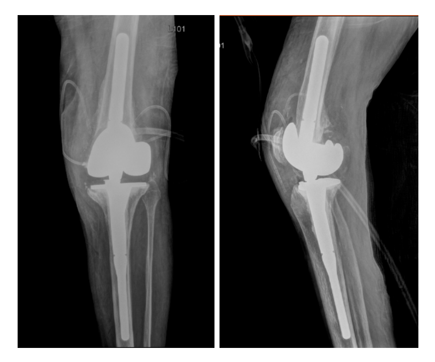
Figure 2. Post-operative anterior–posterior and lateral X-ray showing well fixed long stem femoral and tibial arthroplasty components. No hardware complication is present but generalized osteopenia and expected postoperative changes with intra-articular emphysema. Surgical drain is also noted.