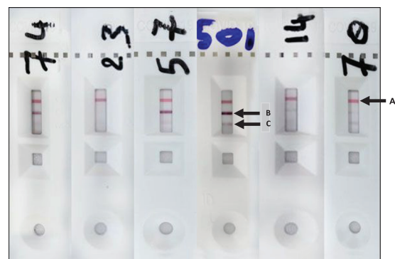
FIGURE 1 A representative figure showing the differential reactivity of both the anti-SARS-CoV-2 IgM and IgG in the studied human sera. The intensities of both the IgM and IgG reactivity in individual human sera ranged between weak, moderate, and strong where the upper band (A) represents a positive control, the middle band (B) represents the IgG reactivity, and the lower band (C) represents the IgM reactivity. IgG, immunoglobulin G; IgM, immunoglobulin M; SARS-CoV-2, severe acute respiratory syndrome coronavirus 2

In fact, the presence of immunoglobulins in human sera is very debatable in terms of their involvement in providing protection to exposed human subjects to viral infection and their capacity to neutralize the infectious virus. 11 Both the presence and duration of the existence of both IgM and IgG become more important 12-14 especially in light of the availability of several vaccines from human use to provide protection against novel corona infection. Whether the presence of IgM and IgG will interfere with the induced protective immunity by the generated vaccines and whether individuals positive for immunoglobulins should be vaccinated remain open questions.