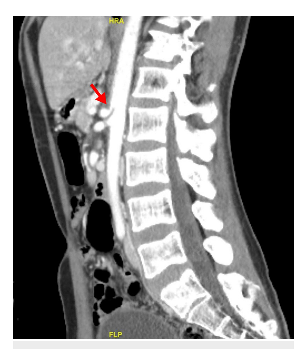
FIGURE 3: Computed tomography abdominal angiography

Computed tomography angiography of the abdomen demonstrated acute angle J-configuration of the takeoff of the celiac axis, with stenosis (red arrow) at its origin and focal post-stenotic dilatation.