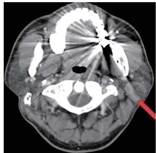
Fig. 1. Preoperative computed tomography findings show heterogeneously enhancing mass (red arrow) with mixed densities measuring about 2.6 × 2.6 cm in the posterior aspect of the left parotid gland. Left internal jugular lymph nodes were also enlarged.

Physical examination revealed a firm, fixed, nontender mass with a dimension of about 3 × 2 cm. The overlying skin had no infection signs, and facial