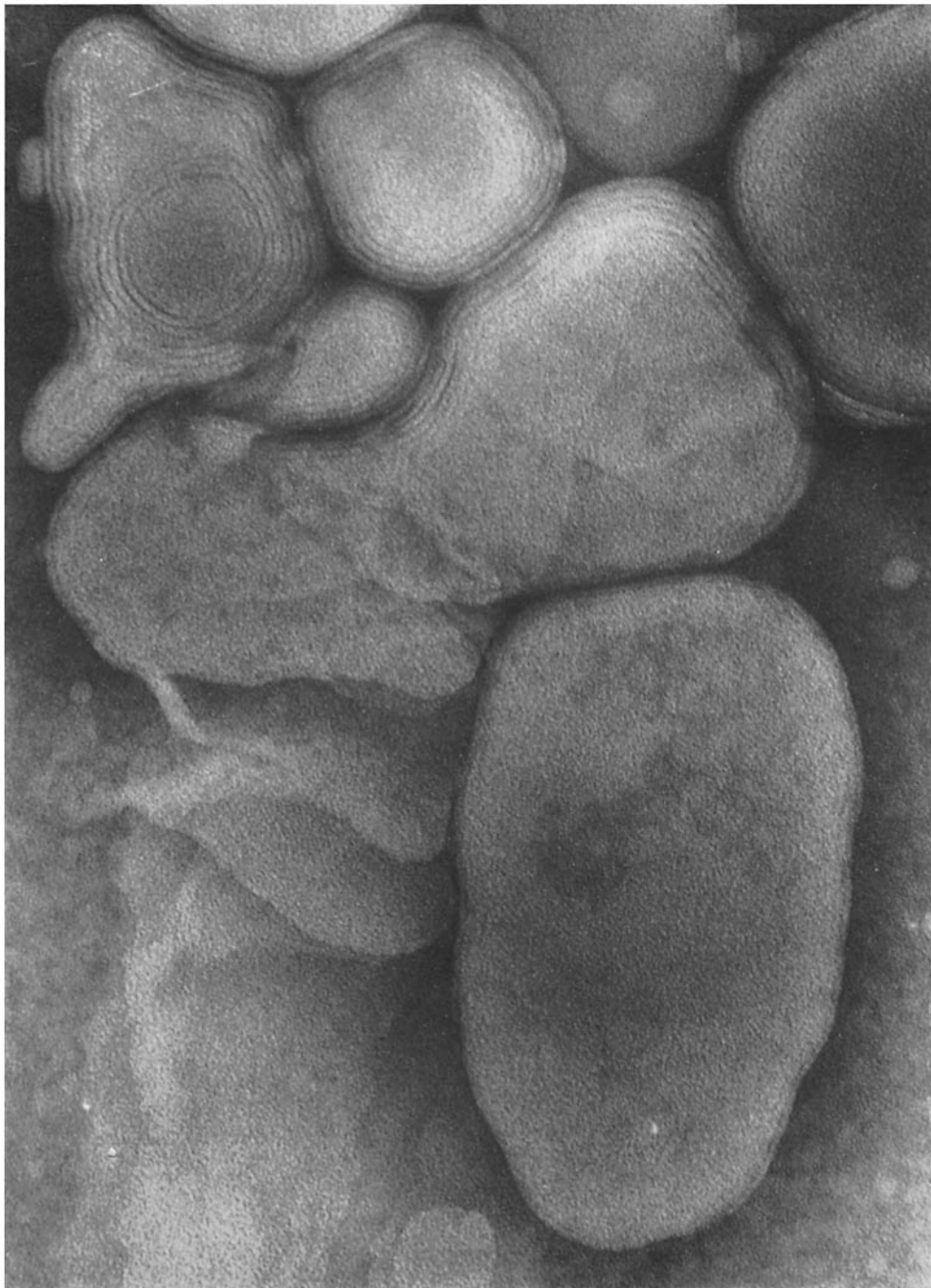
FIGURE 3 Negative staining of the floccules by the salts employed in the tricomplex reaction. Magnification, 280,000.