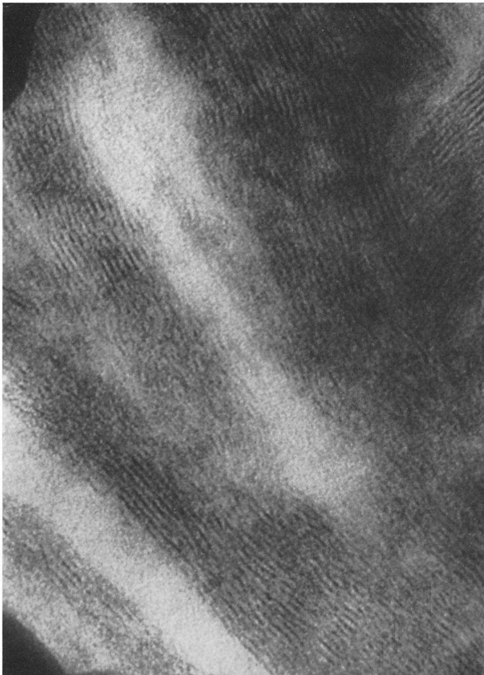
FIGURE 2 Brain phospholipids fixed by the tricomplex method with cobalt nitrate and ammonium molybdate. Magnification, 450,000.