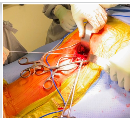
Figure 6: Placement of suture anchor at the ischial tuberosity.