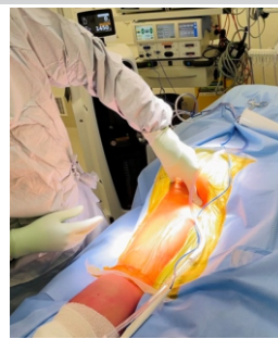
Figure 3: Palpation of ischial tuberosity as a bony landmark for surgical incision.