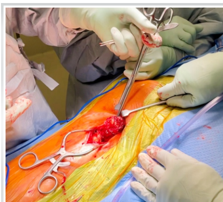
Figure 5: Identifying the tendon stump with three tendon tear.

Once exposed, the suture anchor placement on the ischium should be relatively straightforward. Start off by preparing the surface of the ischium by freshening with a corrugated curette or rongeur for the correct healing of tendons. Transosseous reinsertion of tendons is thereafter performed by first drilling 3-4 tunnels using an awl followed by suture anchor placement (Fig. 6, 7). Modified Mason-Allen stitches are then performed to secure the tendon using the sutures from anchors. The tendons are then pulled to the ischium using the free end of the sutures and tied down with the hip extended and knee flexed to