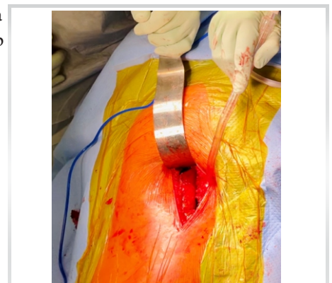
Figure 7: Sutured tendon to ischial tuberosity.