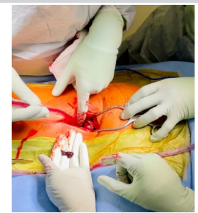
Figure 4: Hematoma at the origin of proximal hamstring rupture.