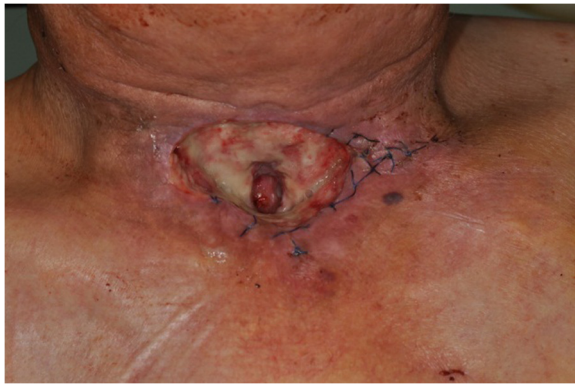
Figure 1 Clinical case of a 55-year-old male, six months after primary radiochemotherapy due to an advanced squamous cell carcinoma of the hypopharynx. Skin atrophy and soft tissue necrosis were observed 8 weeks after the completion of therapy.

(FGF) and platelet-derived growth factor (PDGF) [12]. Nitric oxide (NO) promotes wound healing by an induction of collagen deposition [16]. NO levels have been reduced in irradiated wounds of experimental animals [17]. This finding may explain the impaired strength of irradiated wounds.