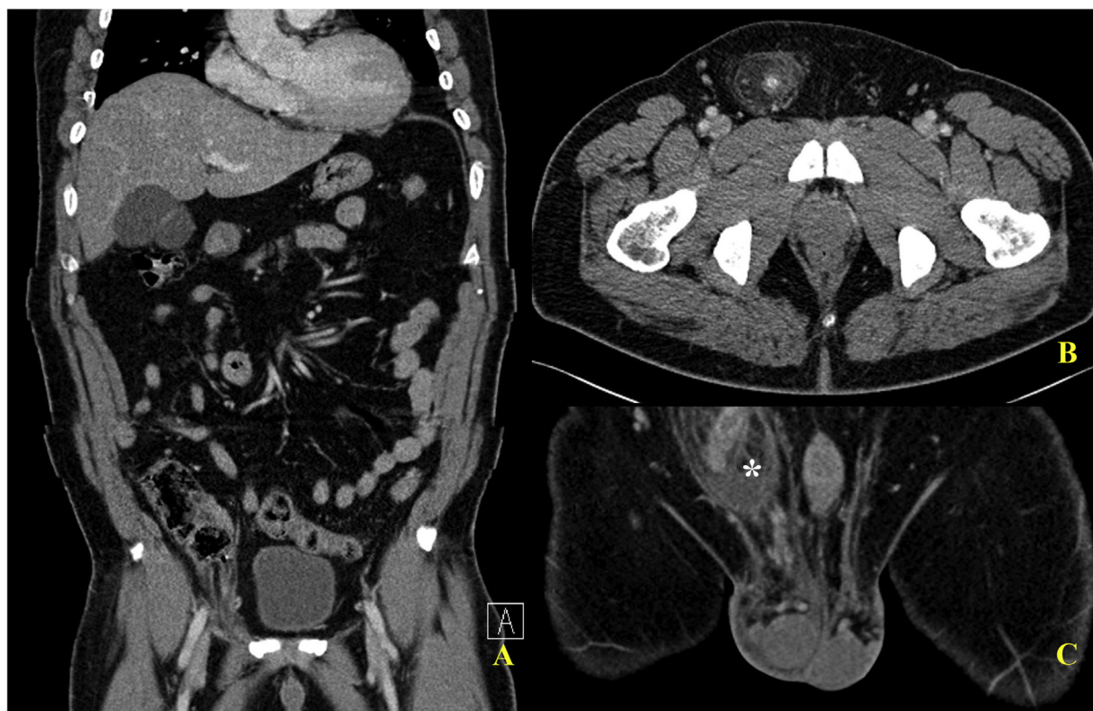
Fig. 1. Contrast-enhanced CT images. (A) A blind-ended tubular structure incarcerated into the right inguinal canal (circle). (B) The incarcerated appendix contained an appendicolith. (arrow) (C) Inflamed appendix with perifocal stranding (asterisk).