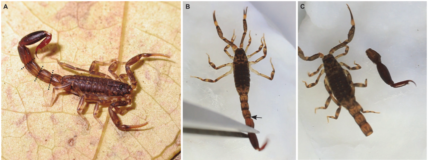
Figure 1. Autotomy in Ananteris Thorell, 1891 scorpions. A. Ananteris balzani Thorell, 1891, adult male from Serra das Araras Ecological Station, Mato Grosso State, Brazil. Dashed lines indicate autotomy cleavage planes between metasomal segments I-IV. B, C. Autotomy in Ananteris solimariae Botero-Trujillo & Flórez, 2011, adult male, video frames. B. Exact moment before autotomy, scorpion fighting to escape. Arrow indicates beginning of cleavage. C. Immediately after autotomy, detached tail twitching.