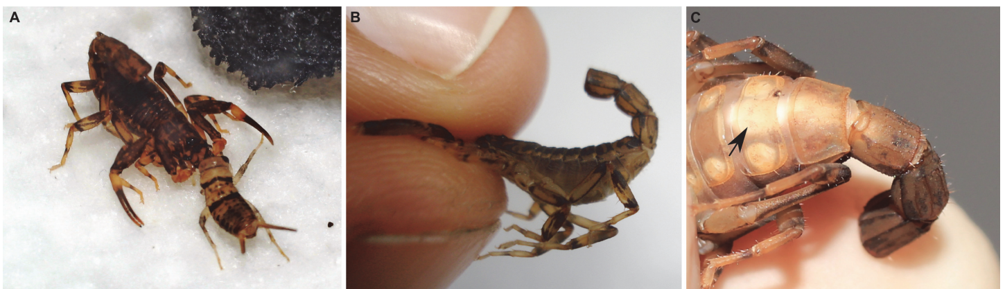
Figure 3. Ananteris solimariae Botero-Trujillo & Flórez, 2011, adult males, twenty-five days after autotomy. A. Feeding on cricket nymph. B. Attempting to sting, showing swollen opisthosoma. C. Accumulated excrement evident as white area inside opisthosoma (arrow).

After autotomy, scorpions attempted to use the remainder of the metasoma to sting prey and for defense, when captured, as if the metasoma and telson were fully intact (Figs. 3A, B). Attempts to attack prey of moderate to large size met without success and these individuals