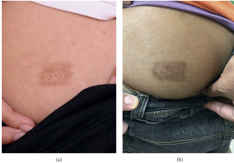
FIGURE 4: (a, b) Comparison of the cosmetic result at 4 months after procedure on the same donor sites of the first and second NCES.