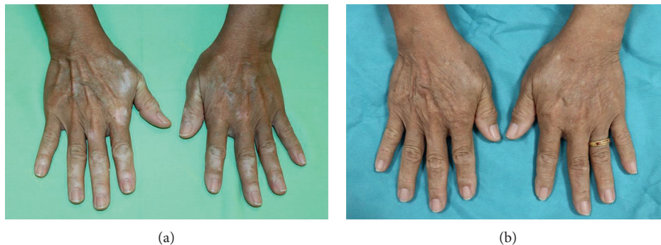
FIGURE 2: An example of a patient who underwent NCES (a) before the procedure and (b) after the first NCES on the right hand and second NCES on the left hand.

NCES; autologous noncultured epidermal suspension; SD, standard deviation.