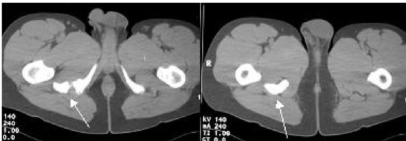
Figure 2 Pre-operative computed tomography images of the pelvis. The arrows point to the heterotopic bony masses.

always be considered in the differential diagnosis. In patients who receive anticoagulants, an intraneural root haemorrhage can also, rarely, occur and a stress fracture could occur due to osteoporosis in those patients receiving corticosteroids. In older patients, degenerative arthritis, which causes narrowing of both the spinal canal and inter-vertebral space, is frequently seen. All of these, less common, intraspinal pathologies can be diagnosed during routine imaging for disc prolapse [3].