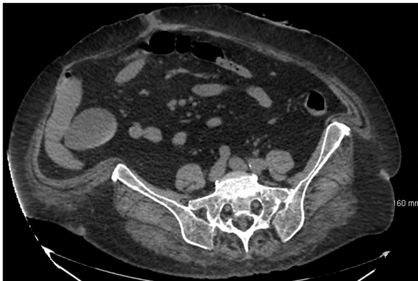
Fig. 1. Preoperative abdominal CT with enormous recurrence of incisional hernia along the right iliac fossa.

in height without dysplasia on biopsy. A multidisciplinary team decided to perform SG initially followed by incisional hernia repair. Open SG was performed. No intraoperative complication occurred. Two weeks later a gastric leak appeared requiring surgical reoperation and drainage by Kehr tube. Fistula was dried up six months later.