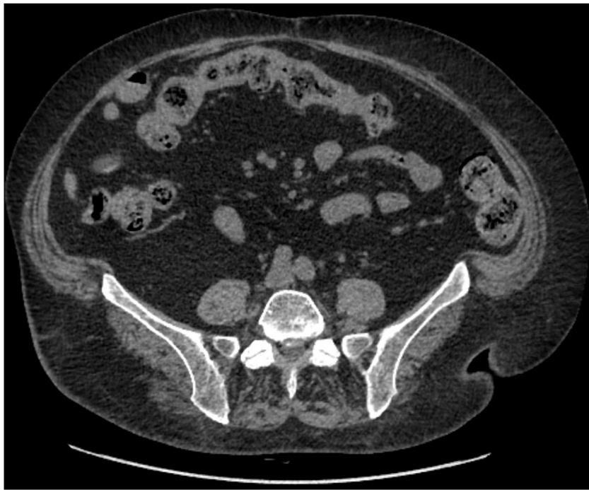
Fig. 2. Abdominal CT scan after definitive cure of the incisional hernias.