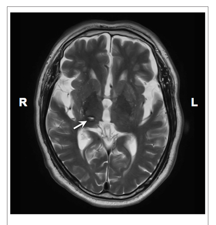
FIGURE 3 | A T2 weighted MRI image showing thalamic lesion in case 2. An arrow indicates the stroke lesion in the right thalamus.

pain system would be desirable in future studies (Thompson et al., 2012). In this context, non-invasive brain stimulation techniques such as TMS and tDCS are excellent treatment options as well as research tools. Since a number of studies have already shown the efficacy of electrical stimulation of the M1 in the ipsilesional hemisphere, neuroplastic changes following