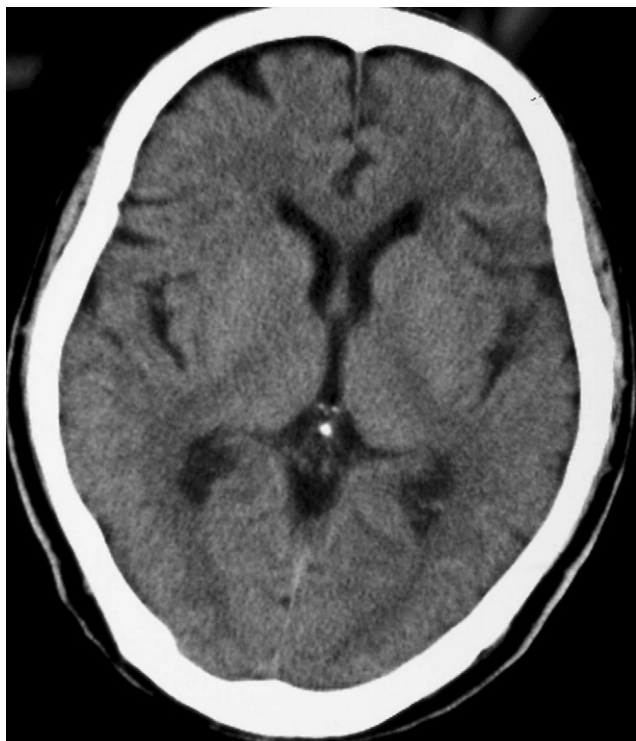
Fig. 3. Cranial CT scan at 2 months after onset of hematoma showing its resorption.

reported that delirium occurs more commonly after hip fracture surgery than elective surgery. For spine surgery, however, there have been few reports of postoperative delirium. Kawaguchi et al 1 pointed out that postoperative delirium occurred in 12.5% of patients aged 70 years or older undergoing surgery.