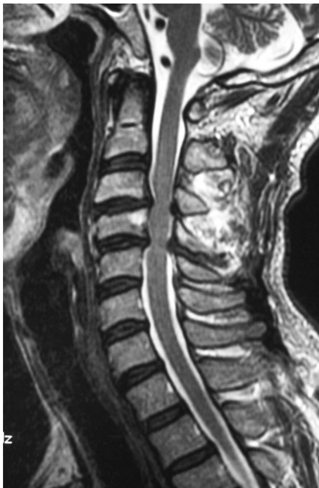
Fig. 1. Cervical T2-weighted image on magnetic resonance imaging examination when the patient visited our clinic with the chief complaint of disturbance of walking, showing multiple compressions of the dural sac in the cervical spine.

on his visit to our clinic (Fig. 1). Physical examination at the time of admission showed spastic gait with exaggerated deep tendon reflexes and pathologic reflexes in both upper and lower extremities. In addition, mild motor weakness and sensory disturbance in both upper extremities were observed.