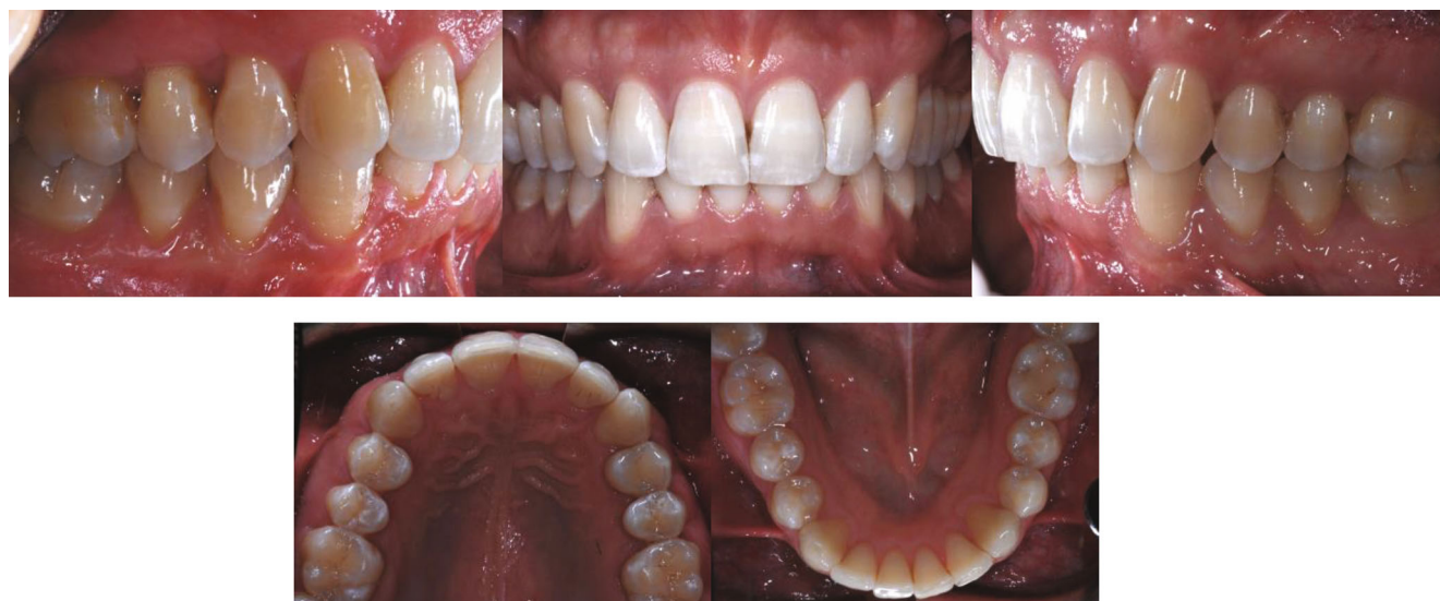
FIGURE 5: Ten-year follow-up.

aesthetic, and easy to wear. Only with the above characteristics, full patient compliance is achieved. For these reasons, patients willingly accept to wear a thermoformed appliance for a long time, showing good occlusal stability after 10 years.