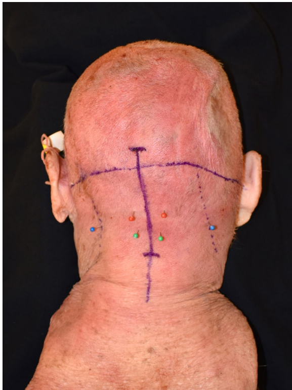
Fig. 1 Marked 8-cm midline incision in the caudal occipital region down into the superior neck. This extended incision was used to demonstrate the landmarks in this cadaveric specimen. A more limited 5-cm incision is typically sufficient to access all of the nerves in vivo. Marked anatomic location of GON 1.5-cm from the midline and 3.5-cm from the EAC (red), LON 6.5-cm from midline and 6-cm from the EAC (blue), TON 1.3-cm from midline and 6.2-cm from the EAC (green)