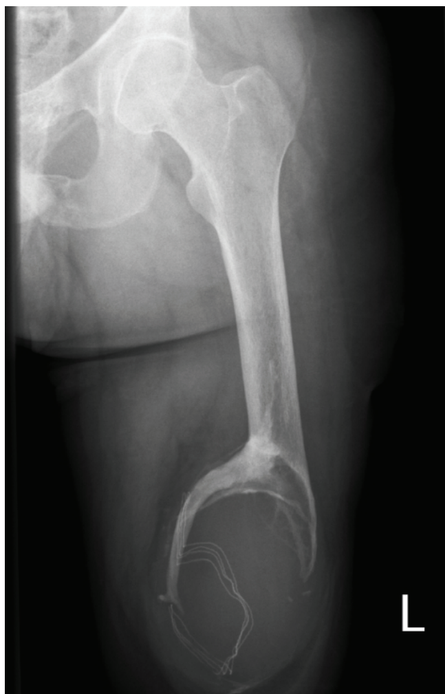
Figure 1. Roentgenogram upper leg with gauze in situ.

After six weeks he could be discharged from the hospital and was measured an advanced prosthetic leg for optimal rehabilitation. It took him 3 months to walk without aids. Two years later he fell on his stump in the bathroom. An X-ray was made of the left upper leg stump to rule out any fracture. The radiologist reported no fracture, but a swelling of soft tissue with calcifications at the femoral