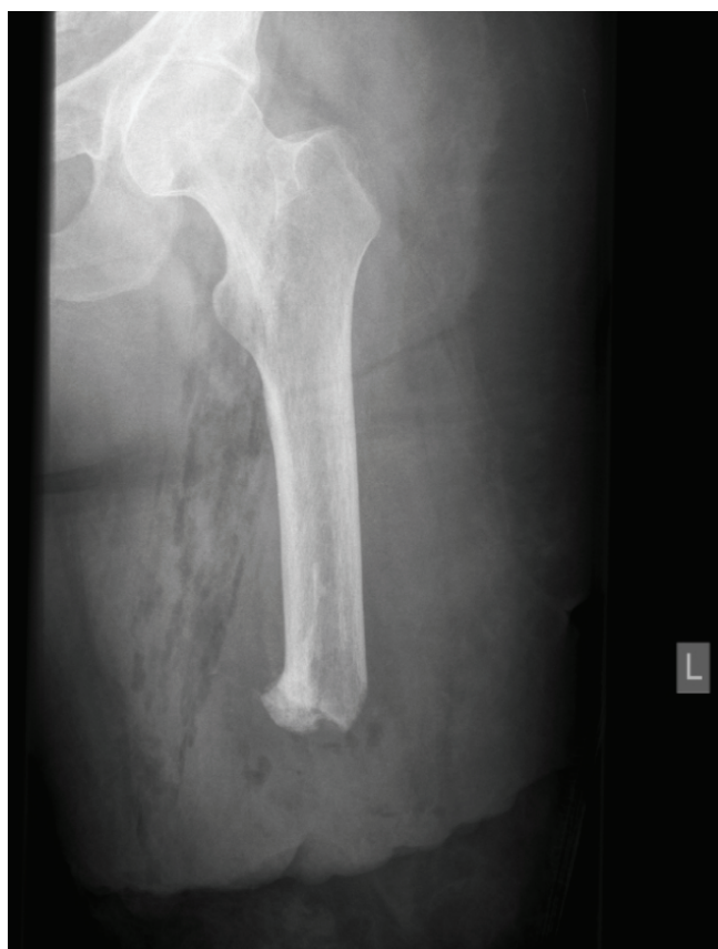
Figure 3. Roentgenogram upper leg after removal of calcifications.

course was further complicated by infectious complications and shortening of the femoral end with removal of all calcifications could not be avoided (Figure 3). Disturbance of wound healing and treatment with vacuum assisted closure devices characterized the clinical course. Five months after initial removal of the gauze, a definitive stump correction was carried out without complications and a rehabilitation program with a new prosthesis could be initiated.