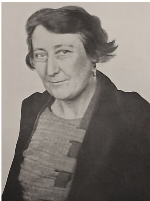
Fig. 1. Marjory Stephenson.