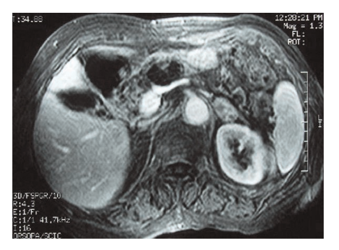
Figure 3. Gadolinium enhanced, fat saturated, gradient echo axial MRI disclose complete absence of enhancement of the mass at the pancreatic neck consistent with its cystic nature.

Pancreatic serous cystadenomas are rare neoplasms, predominately affecting women (65%) at the seventh decade of life. Small neoplasms are usually asymptomatic, and the symptoms, most of which are non-specific, are caused primarily by a large space-occupying tumor mass. Systemic symptoms such as weight loss, malaise, anorexia,