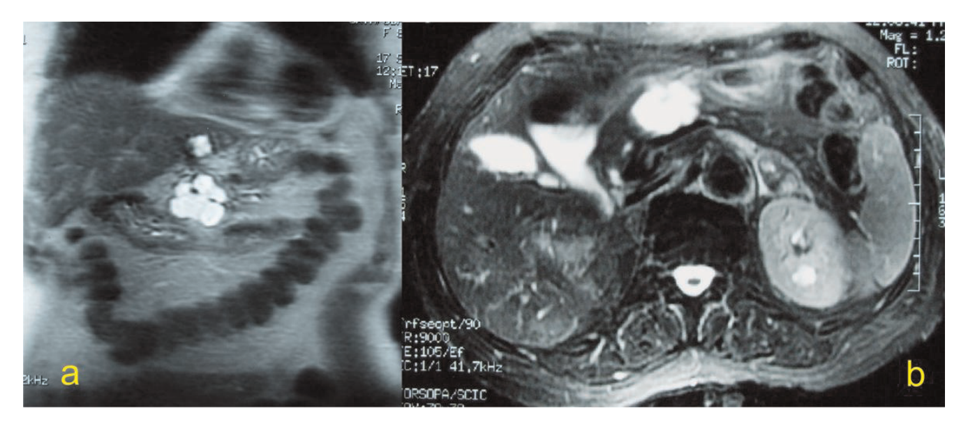
Figure 2. Coronal T2 weighted (a) and axial T2 weighted fat saturated (b) MRI reveal a multiloculated cystic mass at the pancreatic neck. A simple cyst at the left lobe of the liver is also seen at the coronal plane (a).

(functional and nonfunctional), acinar cell cystadenocarcinomas, cystic choriocarcinomas, cystic teratomas, and cystic lymphangiomatous neoplasms [10].