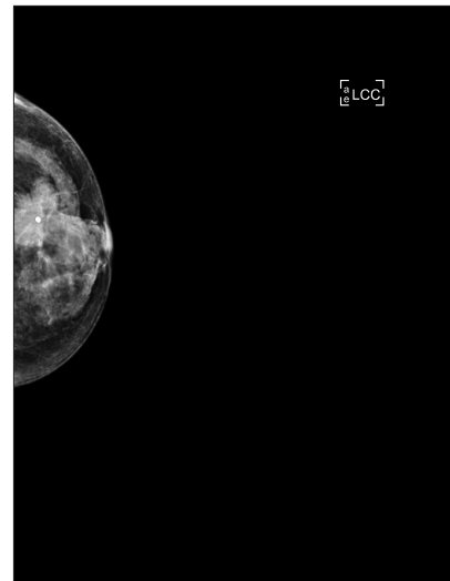
Fig. 5. Left breast mammogram showing left side breast cancer.

Postoperatively the histology showed a large gastric ulcer with inflammation and fibrosis with NO evidence of malignancy. 22 lymph nodes were resected which were all negative for malignancy.