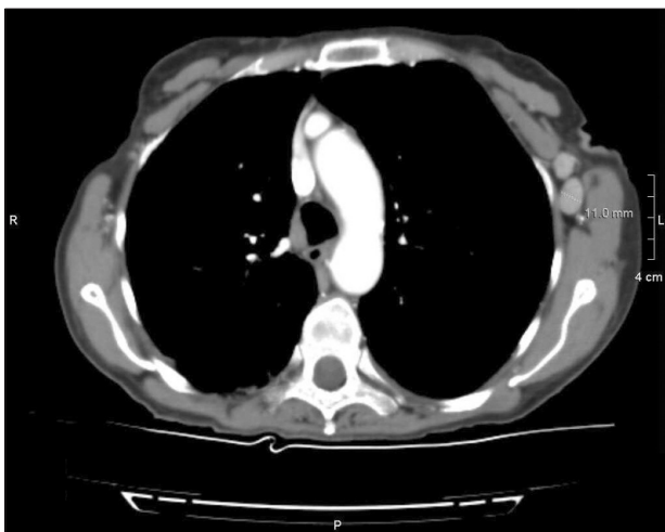
Fig. 4. CT thorax showing left axillary lymphadenopathy, one of the lymph node measured 11 mm as shown on the scan. CT = computerized tomography.