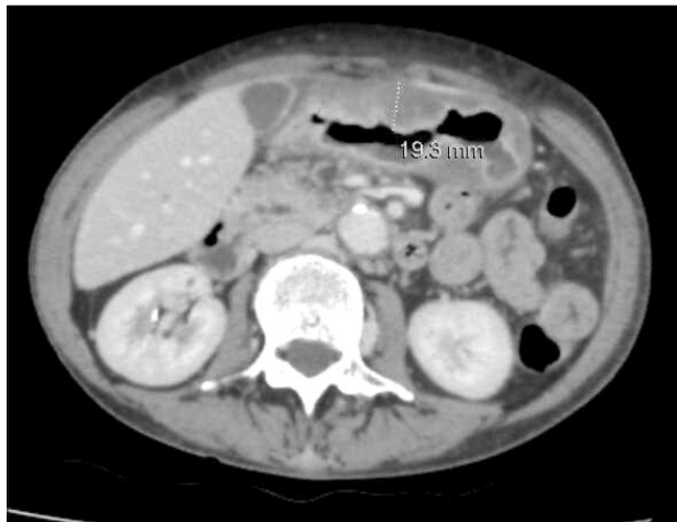
Fig. 1. CT abdomen showing thickening of the gastric antrum which measured approximately 19.3 mm. CT = computerized tomography.

ER \alpha = oestrogen receptor \alpha ; GCDFP-15 = gross cystic disease fluid protein-15.