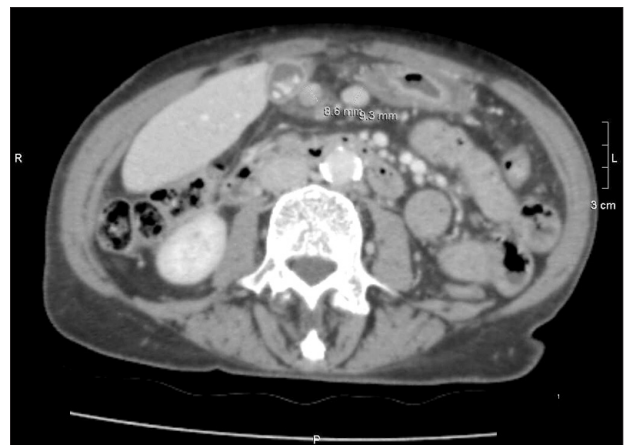
Fig. 2. CT abdomen demonstrates the mesenteric lymphadenopathy, showing two lymph nodes measuring 8.6 and 9.3 mm. CT = computerized tomography.

The tumour cells are diffusely and strongly positive for oestrogen receptors, negative for progesterone receptors, positive for E-cadherin which is consistent with an invasive ductal carcinoma and Herceptin 2 receptors positive.