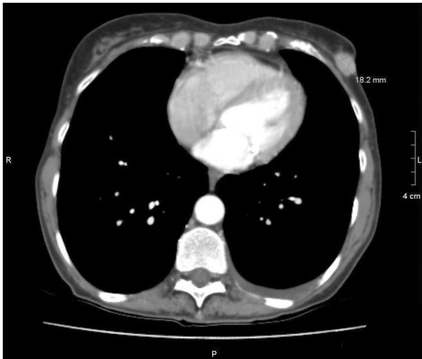
Fig. 3. CT thorax showing an incidental finding of a left side breast tumour measuring 18.2 mm as demonstrated on the scan. CT = computerized tomography.

This was all discussed in the Multidisciplinary team meeting and it was that in evidence of oestrogen receptors being positive in the breast tumour and negative in the stomach tumour that the patient most likely had two primary tumours.