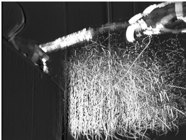
Fig. 3. Visualization of aerosol particles by light-emitting diode during simulated endoscopy.

measured from the videos based on a 0.128 cm/pixel length.