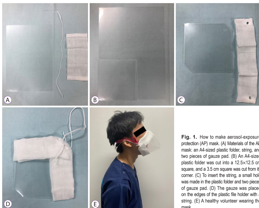
Fig. 1. How to make aerosol-exposure protection (AP) mask. (A) Materials of the AP mask: an A4-sized plastic folder, string, and two pieces of gauze pad. (B) An A4-sized plastic folder was cut into a 12.5 \times 12.5 cm square, and a 3.5 cm square was cut from its corner. (C) To insert the string, a small hole was made in the plastic folder and two pieces of gauze pad. (D) The gauze was placed on the edges of the plastic file holder with a string. (E) A healthy volunteer wearing the mask.

First, an exploratory study was performed to investigate the efficacy of aerosol-exposure prevention by the AP mask in a preclinical setting in a clean room where we could eliminate air dust and precisely visualize and measure the aerosol. Study 1 was not conducted in a real clinical setting because of the need for these specific requirements and limited space. Study 1 included only three volunteers. Three healthy volunteers were recruited from the National Cancer Center Hospital, Tokyo, Japan. In Study 2, the AP mask was clinically tested in patients with early esophageal and gastric endoscopic mucosal