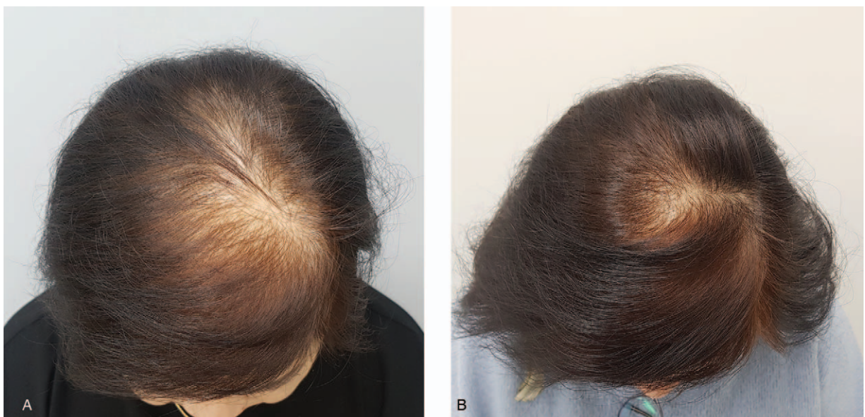
Figure 4. Hair vertex view of global photography of a 62-yr-old female patient in the treatment group, diagnosed with Ludwig type II hair loss. Compared to baseline, there was a 25% increase in hair density and a 3.1% increase in hair thickness at 16 wk. A. Baseline, B. 16 wk.