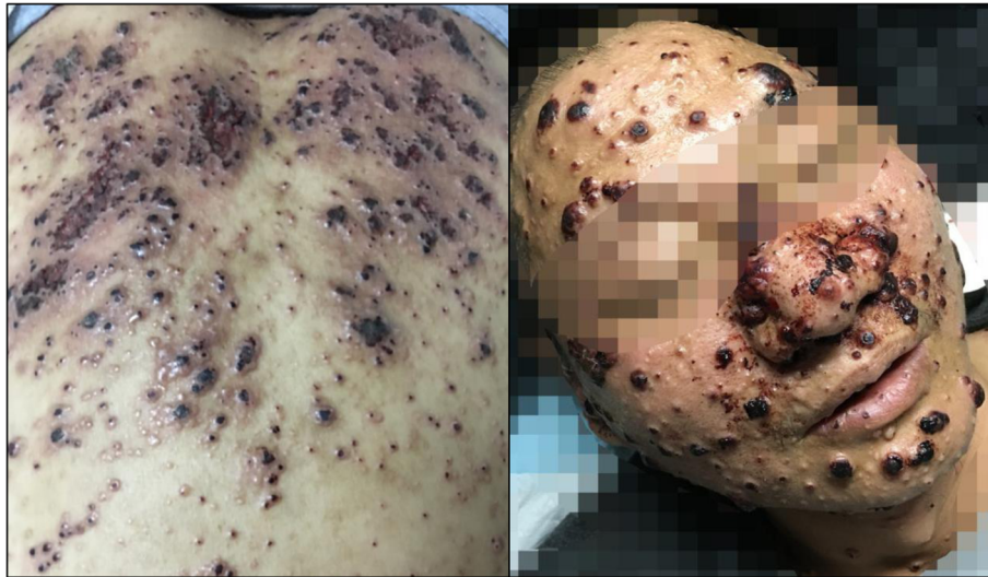
Fig. 2 Chest CT of the patient showed features of pulmonary infection, with localized emphysema at the right lower lung, and multiple mediastinal lymphadenopathy