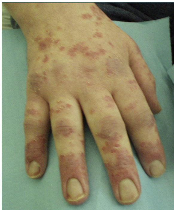
Figure 2 Hands of the patient with psoriatic-like eczema and arthritis.

moderate intra-lobular necro-inflammatory activity with no other significant changes (Fig. 1). AIH score without treatment was 3 (probable if > \text{or} = 10 ) and simplified score was 5 (probable if > \text{or} = 6 ). Treatment was started with peg-IFN \alpha 2a 180 mcg plus RBV 1200 mg, under close monitoring of liver biochemistry during the initial weeks. The patient achieved a fast normalization of transaminases, rapid virologic response (RVR), negatization of ANA positivity and decrease of IgG levels. At week 22, he sought his clinician due to a psoriatic-like eczema and arthritis (Fig. 2) with functional limitation. Due to suspicion of latent psoriatic arthritis not previously diagnosed, the patient was evaluated by Rheumatology and started methotrexate (MTX)