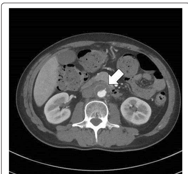
Fig. 1 Preoperative CT scan. Axial view showing a small sacciform infrarenal abdominal aortic aneurysm (white arrow)