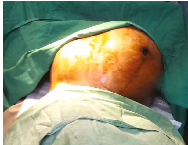
FIGURE 1: Outline of the uterus and the uterine fibroid before surgery.

Elective caesarean section was carried out under spinal anaesthesia at 35 weeks of gestation. Figure 1 shows the outline of the uterus and the uterine fibroid before the commencement of the operation, with the uterus deviated to the right flank and the fibroid located centrally. The abdomen was then opened by a midline subumbilical incision. The huge subserous uterine fibroid was located centrally with the uterus deviated to the right abdominal flank. The outcome was a live female infant of birth weight 2.3 kg and Apgar scores 5 and 8 at 1 and 5 minutes, respectively. Following the delivery of the baby, the uterine incision was repaired. The uterus was then exteriorized, and the relationship of the fibroid to the uterus is as shown in Figure 2. Thereafter, a Foley catheter size 18FG was applied as tourniquet at the level of the internal cervical os; intracapsular myomectomy was successfully performed with careful closure and good homeostasis ensured. The fibroid nodule as seen in Figure 3 showed areas of cystic degeneration and weighed 9.5 kg. It