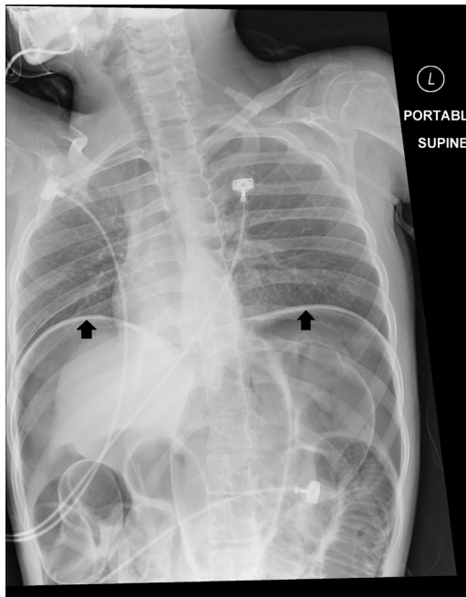
Figure 1. Initial chest x-ray demonstrating elevated diaphragm (black arrows).