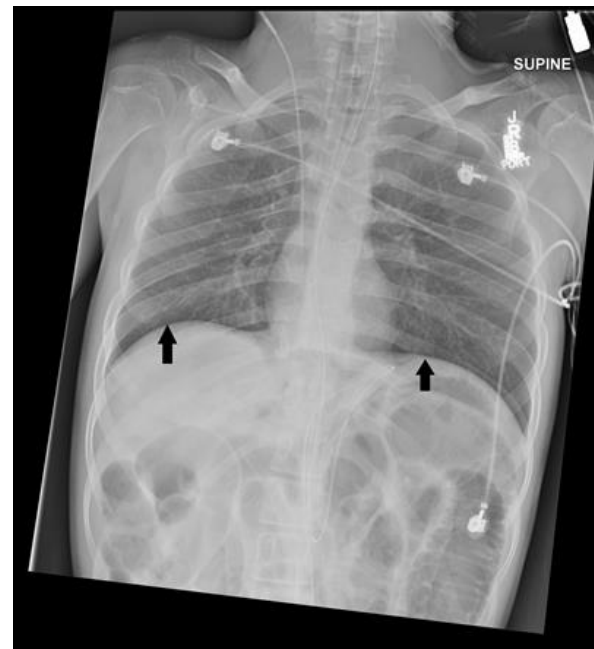
Figure 3. Chest x-ray performed after needle decompression of abdomen demonstrating improved diaphragmatic excursion (black arrows).