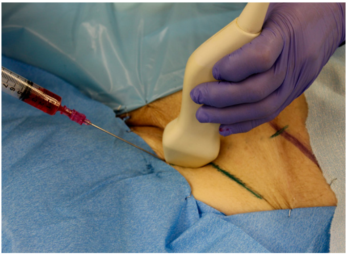
Figure 3. A drape is used to hide the exposed latex tubing and Toomey syringe. The model is now ready for implementation.