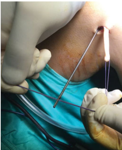
Fig. 5 The suture shuttle used to pull the graft from the patellar to the femoral side is inserted into the eyelet of the femoral guidewire and used to pull the graft through the femoral tunnel.

an aperture fixation was assured both at the femur and at the patella. The procedure presented here represents a modification of the technique initially introduced by Schöttle et al. 6 The main difference of this procedure compared with the Schöttle's one was that semitendinosus was used instead of gracilis, since in patients with a short gracilis this tendon