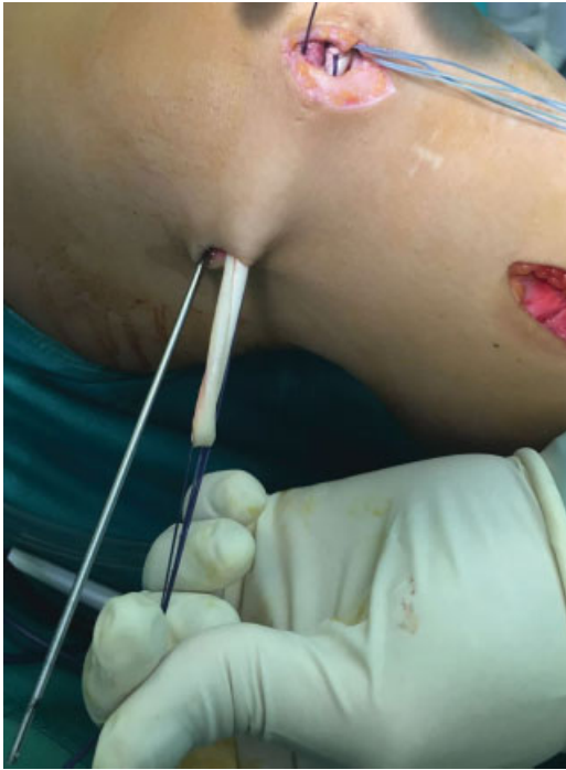
Fig. 4 The suture loop is carried by the curved clamp at the medial patellar border and used to pull the graft from the patellar side to the femoral insertion point.

an aperture fixation was assured both at the femur and at the patella. The procedure presented here represents a modification of the technique initially introduced by Schöttle et al. 6 The main difference of this procedure compared with the Schöttle's one was that semitendinosus was used instead of gracilis, since in patients with a short gracilis this tendon