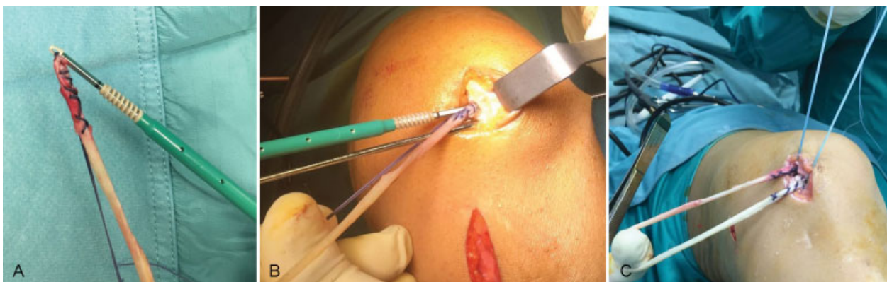
Fig. 1 The graft sutures are pulled through the eyelet of the SwiveLock (Arthrex, Naples, Florida, United States) (A), and pushed into the drill holes (B). Keeping the suture under tension, the graft ends are fixed with the SwiveLock anchor leaving the graft loop free (C).

For an anatomical femoral insertion of the graft, the medial epicondyle and adductor tubercle are palpated. A 1-cm longitudinal incision is made in this area, and a 2-mm guidewire with an eyelet is placed at the correct femoral MPFL insertion point. The guidewire placement is controlled by an image intensifier on a straight lateral view to obtain and identify the anatomical femoral insertion point. It has been shown 7 to be located 1 mm anterior to an elongation of the posterior femoral cortex in between the posterior articular border of the medial femoral condyle and the most proximal point of the Blumensaat line (→ Fig. 2). At this point, the isometry of the MPFL may be evaluated by maintaining adequate tension on the graft and cycling the knee through the full range of motion (ROM). When the isometry