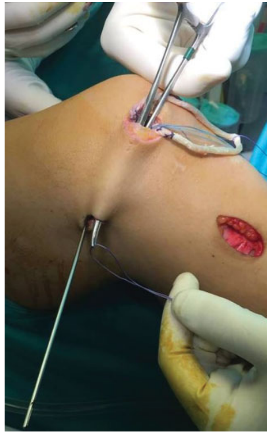
Fig. 3 As the MPFL is situated in the second layer of the medial patellofemoral complex, a tunnel between the superficial medial retinaculum and the joint capsule is created, and an angled clamp is brought into this space and directed toward the femoral MPFL insertion, cautiously avoiding any injury to the joint. A suture loop is then inserted into this tunnel using the angled clamp. MPFL, medial patellofemoral ligament.

At this point, a blunt dissection is performed to create a soft-tissue tunnel in layer 2 of the medial soft-tissue structures from the patellar insertion point to the femoral insertion point, deep to the superficial medial retinaculum (layer 1) but superficial to the synovium (layer 3), being careful to leave the capsule intact. A no. 2 suture loop is passed from the femoral side to the patellar one through this space using an angled clamp (► Fig. 3 ). The suture loop is used to carry the graft from the patellar side to the femoral insertion point (► Fig. 4 ). The suture shuttle used to pull the graft is then inserted into the eyelet of the femoral guidewire (► Fig. 5 ), and the graft is successively passed through the femoral tunnel by pulling the guidewire and the suture shuttle out of the lateral side of the knee. Equal tension on both graft bundles is maintained during graft passage into the femoral half-tunnel. Femoral fixation is achieved with a biodegradable interference screw 1 mm larger than the graft, which is passed over a nitinol guidewire. Femoral fixation is per-