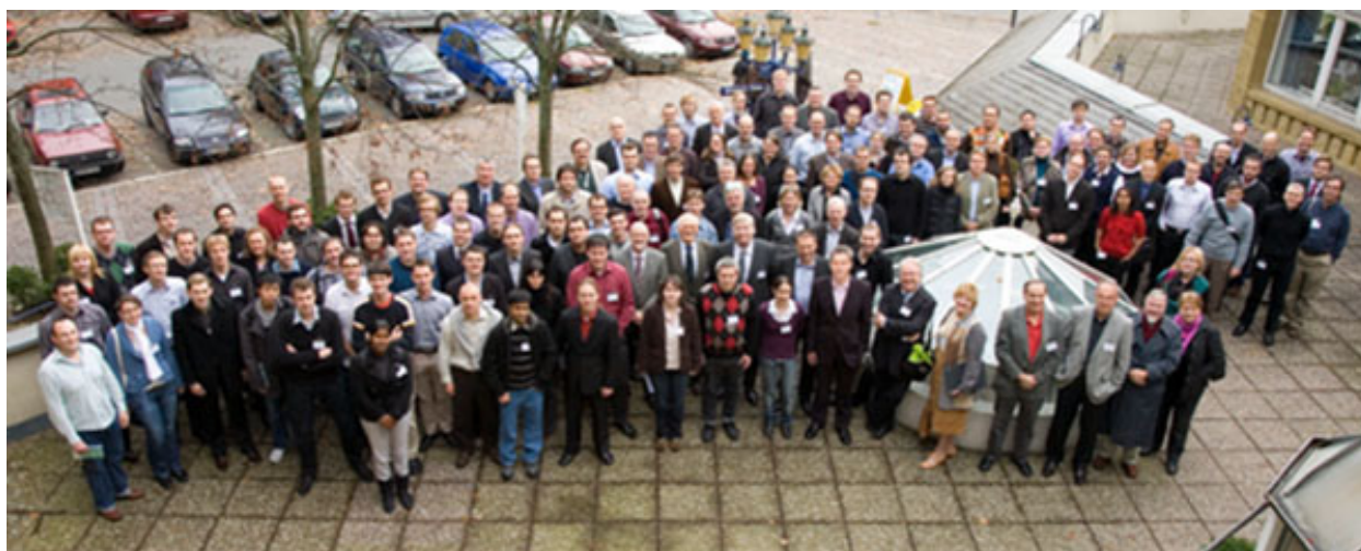
Figure 1 Participants of the 6. German Conference on Chemoinformatics, November 7–9, 2010, Goslar, Germany.