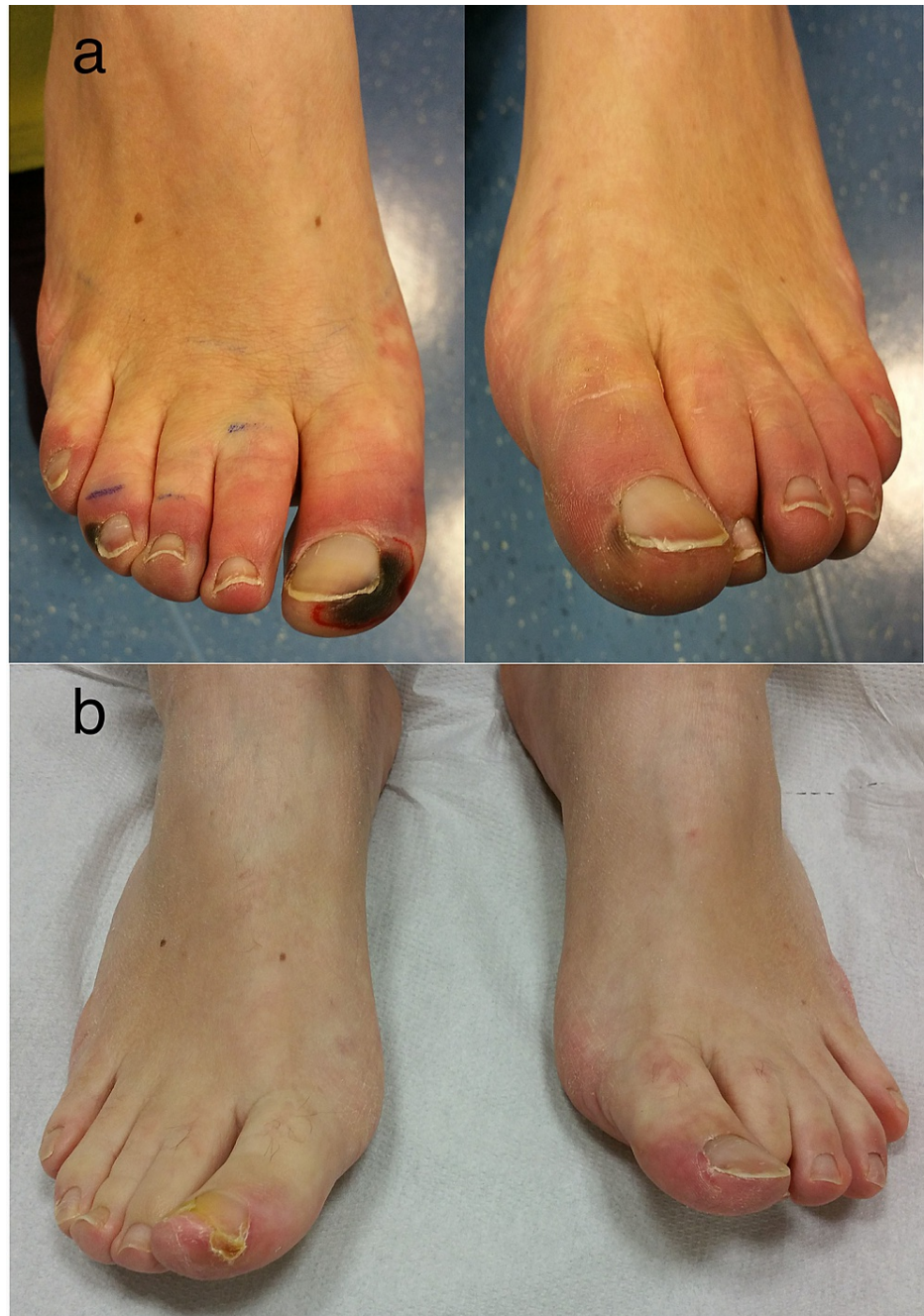
FIGURE 1: (a) Signs of incoming ischemia and necrotic ulcers of toes at admission in 2016, when diagnosis of necrotizing Raynaud's phenomenon was made. (b) Complete remission of ulcers at two months, after spinal cord stimulator implant