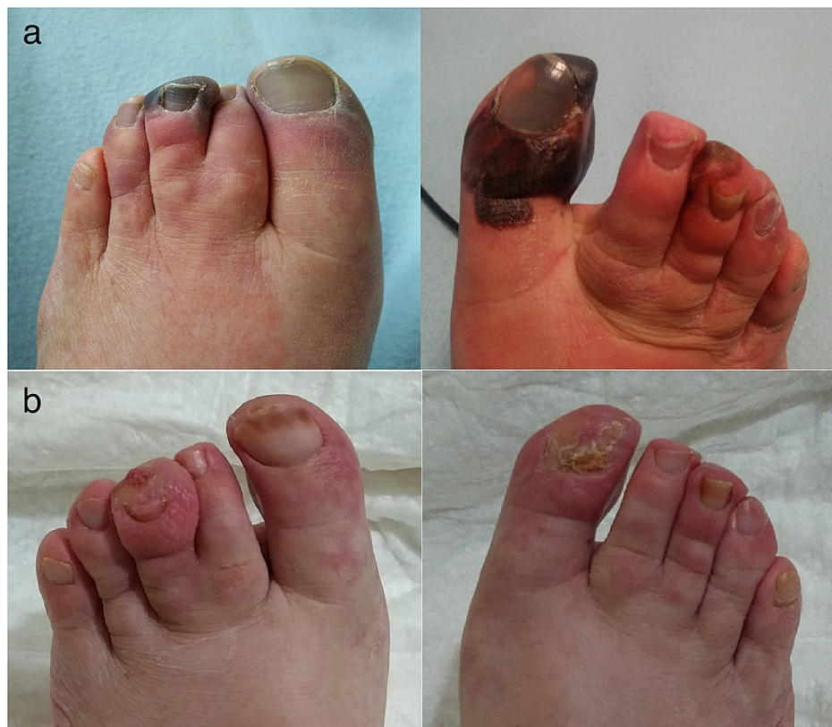
FIGURE 3: (a) Signs of incoming ischemia and necrotic ulcers in both feet after the admission in October 2020, at the admission in hospital. (b) Necrotic ulcers healing in January 2021