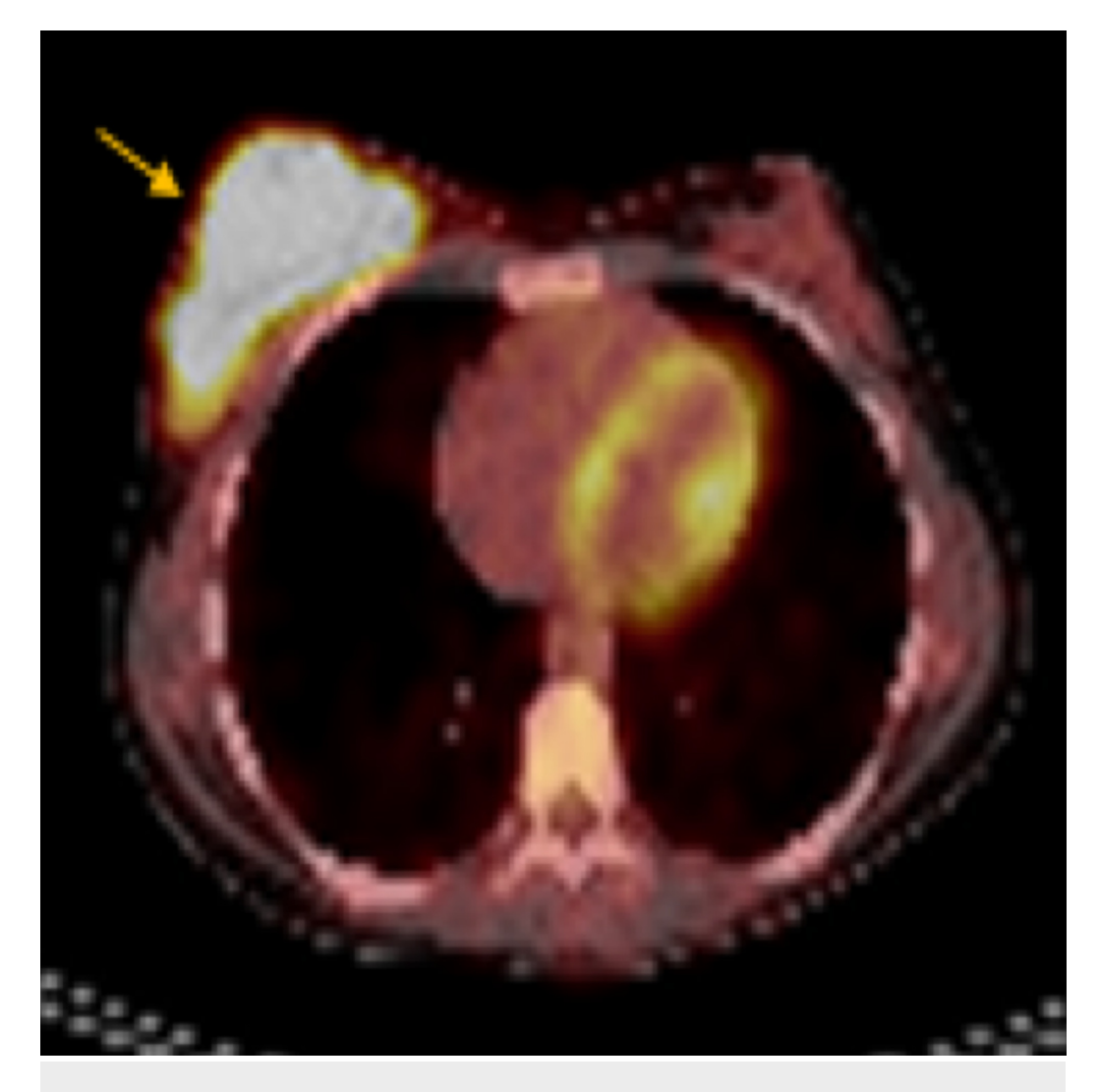
FIGURE 3: PET-CT: Isolated metastasis of melanoma to the right breast (12 SUV)

PET-CT: positron emission tomography-computed tomography